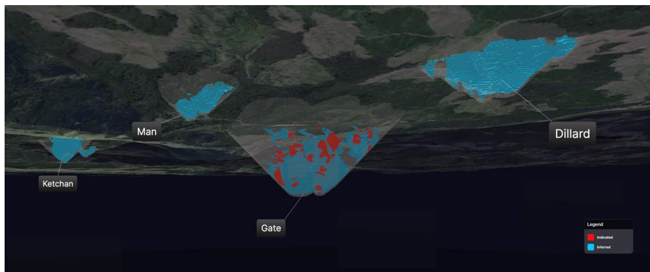
Figure 2: MPD Project – RPEEE shells used to constrain the Initial Mineral Resource Estimate